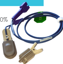
SpO 2 cable and clips