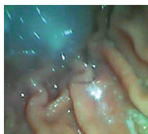
3.5 kg feline stomach