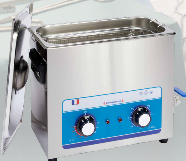
Ultra-C6 6 liters